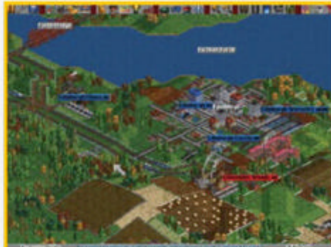
» [DOS] There were a handful of created scenarios to deal with, but for many the randomly generated sandbox levels were the crux of the game.