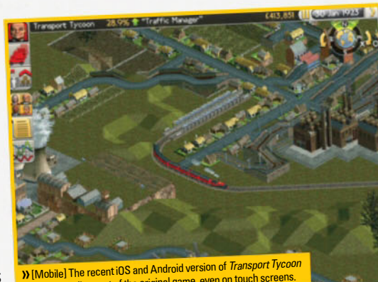
» [Mobile] The recent iOS and Android version of Transport Tycoon is an outstanding port of the original game, even on touch screens.

I think it harks back to my fascination with isometric viewpoint graphics again. I started to tinker with creating an isometric display system on the PC in my spare time while still doing the conversion work. I think I even started creating a little platform-type isometric game, just to test the isometric system.