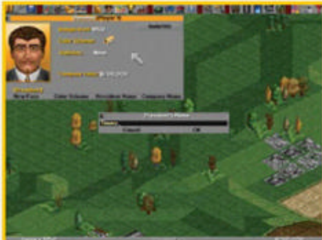
» [DOS] Founding your own company, naming it, picking your face and colour all helped make Transport Tycoon feel a little more personable than SimCity .