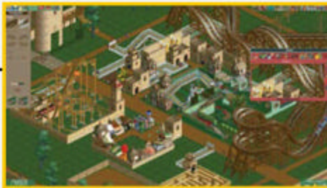
» [PC] The sequel focused heavily on the design and decoration of your parks, but added in a ton of extra rides and roller coasters to build, too.

Once Transport Tycoon Deluxe was finished I actually signed a deal to create Transport Tycoon 2 , and worked on it on and off for nearly a year I think before eventually losing interest. I think at the time I was also struggling a bit with adapting to Windows/DirectX development after years of developing under DOS. Transport Tycoon 2 actually got to the stage of having vehicles moving around, albeit without any decent graphics – I had re-written the isometric game world system to handle multiple levels of bridges and tunnels as this was something I felt that would make Transport Tycoon a much more three-dimensional game, allowing elevated railways and maybe even underground systems. I got to the point where I felt I couldn’t carry on with the game though, I was struggling for